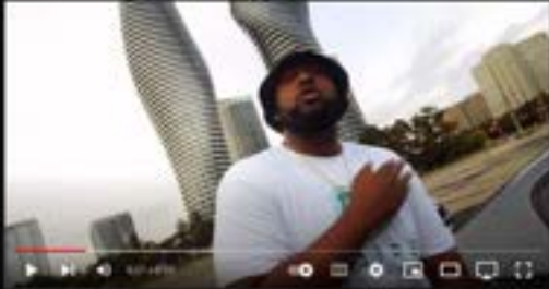
NO LOVE LOST